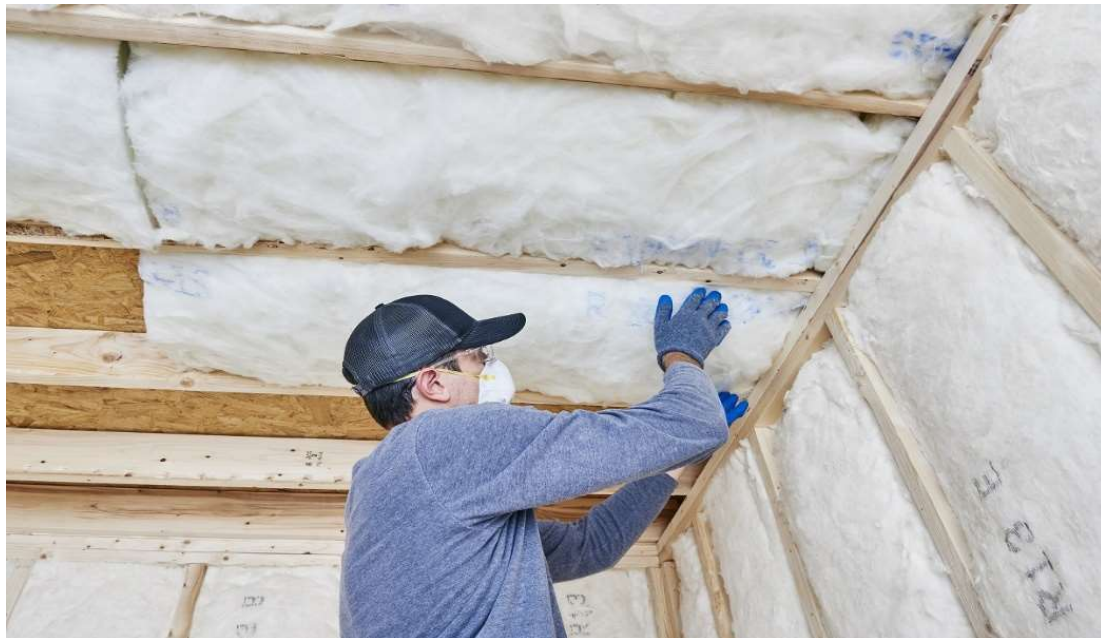
Figure 2 : Installation of fiberglass insulation in the walls and ceilings [9]

30 % Fiberglass is made from recycling waste material. This factor makes it environment-friendly. People can easily install it on their roofs because it is flexible. Its flexible nature reduces its cost.